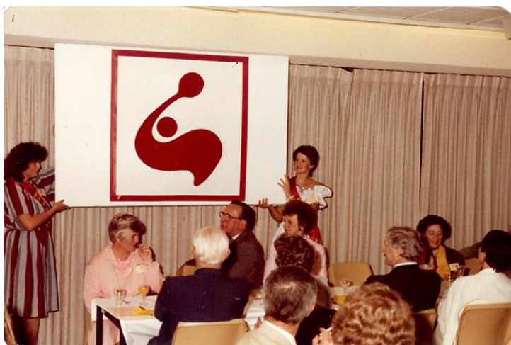
Launch of 1986 Fourth World Junior Men's Squash Championships with specially designed event logo.