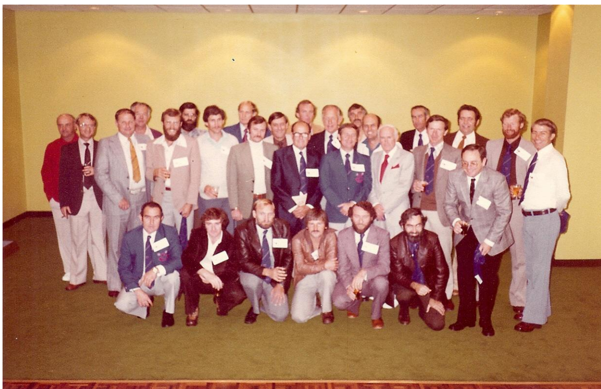
Gathering of Past and Present Committee and Sub-Committee, 1985.