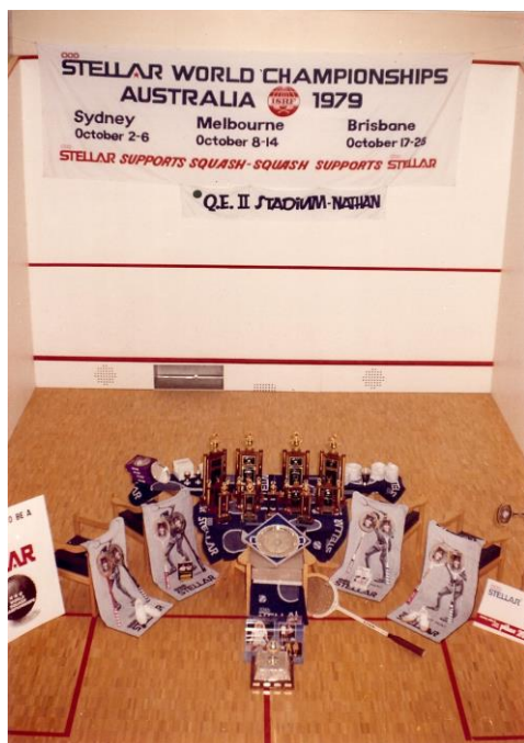
Trophies on display, Stellar World Teams' Championship at QEII Stadium 1979.