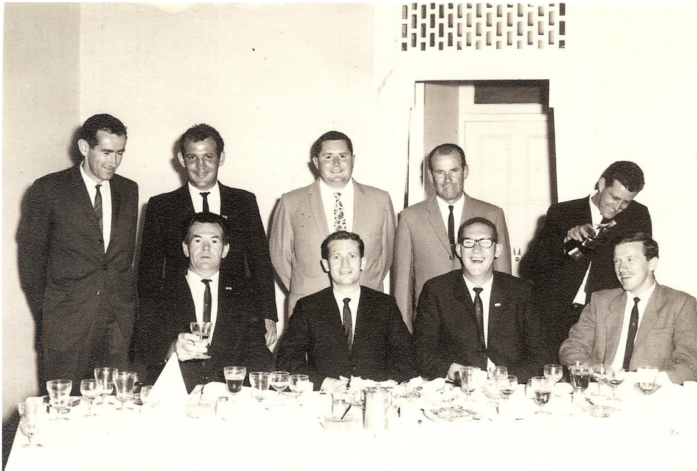
BDSRA Committee, 1960's.

The following Photos are a small collection covering the 26-year history of the BDSRA. Unfortunately, the official BDSRA Photo Album is not available. Photos of interest would be most welcome.