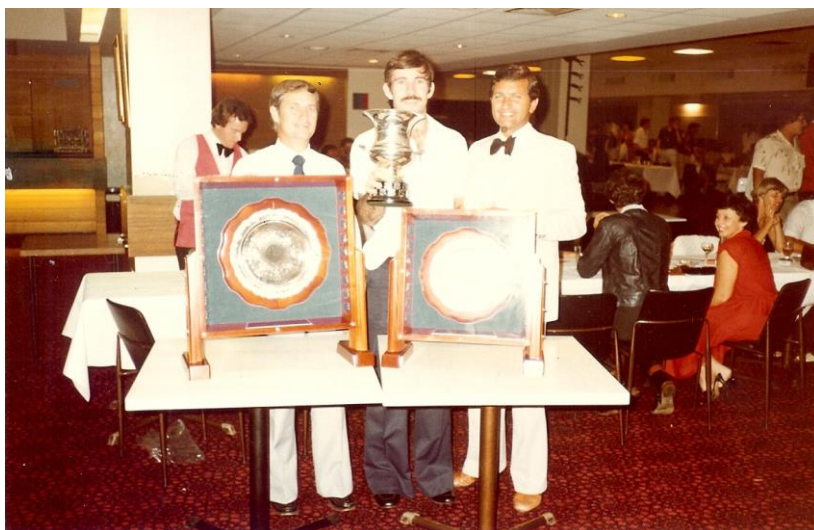
Brisbane 1 and Brisbane 2 competition trophies.