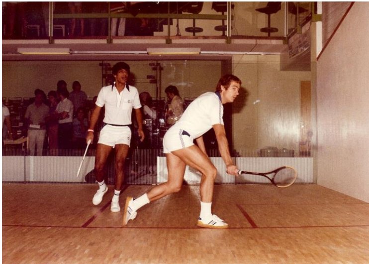
Two of the world's greatest squash players of all time, Jahangir Khan (Pakistan) and Geoff Hunt (Australia) meet on court for the first time at QEII Stadium, September 1979.