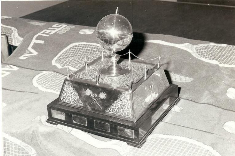
Main trophy, Stellar World Teams' Championship.