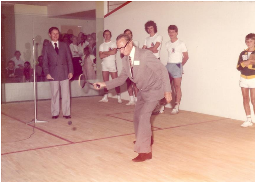
Lord Mayor Frank Sleeman "hitting the first ball" at QEII Stadium, 25 th September, 1979.